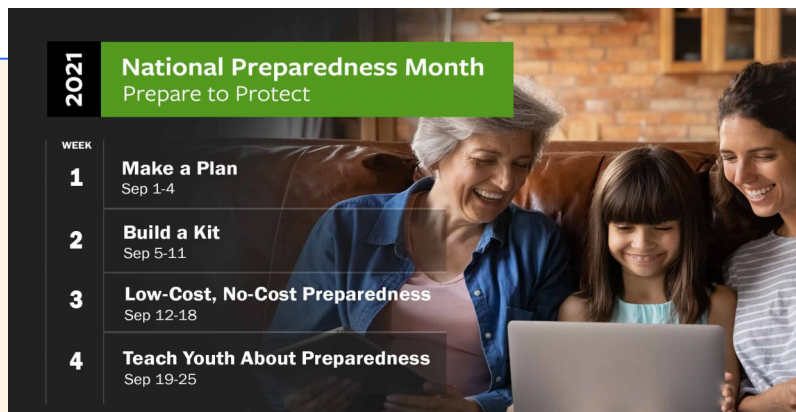
AAEM—A family of emergency management professionals working together to enhance preparedness across the State of Alabama